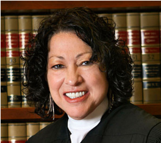
Sotomayor’s “wise Latina” remarks were taken out of context to imply that she was some kind of ethnic supremacist

white people could not expect to be treated fairly by Sotomayor, and that her nomination was further evidence of racial bias in the Obama administration. In addition, some commentators slammed the very notion of diversity. Many picked up the “white men need not apply” headline Mark Halperin put on an article about the court vacancy. Pat Buchanan derided the number of women on the president’s reported short list and denigrated Judge Sotomayor as an “affirmative action” pick while suggesting without any